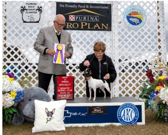
Progressive Toy Group Show 2 Bests of Breeds