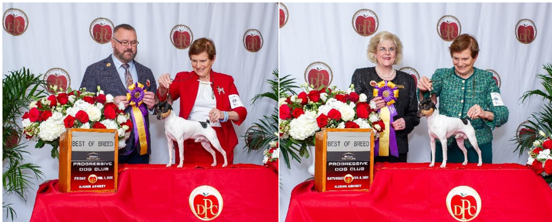
And Two Group 3's in Miami!