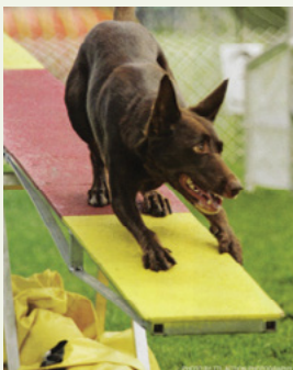
Figure 5. Kelpie gripping the teeter for stability.