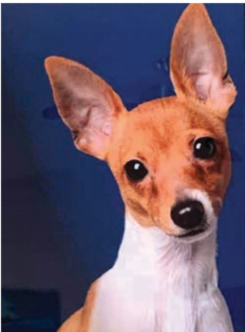
White and tan.

There are many things to consider when breeding, exhibiting, and judging Toy Fox Terriers. Shoulder and rear angulation, squareness of the dog, proportions, coat texture, ear placement, headpieces, and so forth. But by far and away the two questions I get most involve color and size. I am going to address color today.