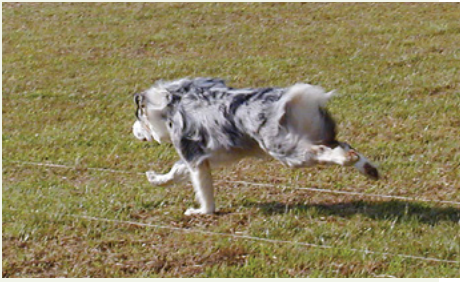
Figure 2. In this galloping dog, the dewclaw is in touch with the ground. If the dog needs to turn to the right, the dewclaw will dig into the ground to stabilize the lower leg and prevent torque.

So, here's a plea to retain dogs' dewclaws. They are a functioning digit. They are the toe least likely to be injured. Isn't this enough to convince us not to do the dewclaws? ■