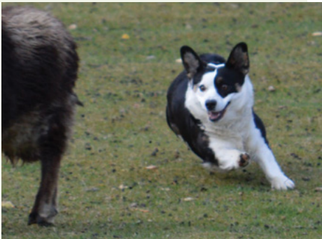
Figure 3. Corgi using its left dewclaw while herding.