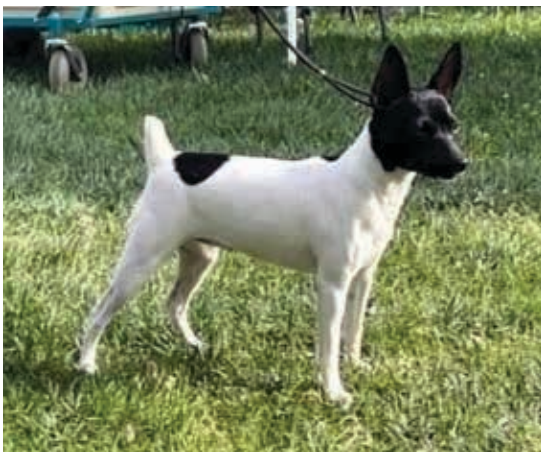
White with Black.