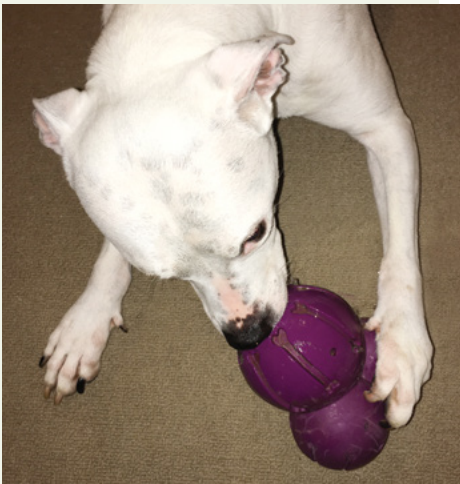
Figure 4. Dog using left dewclaw to grip a food toy.