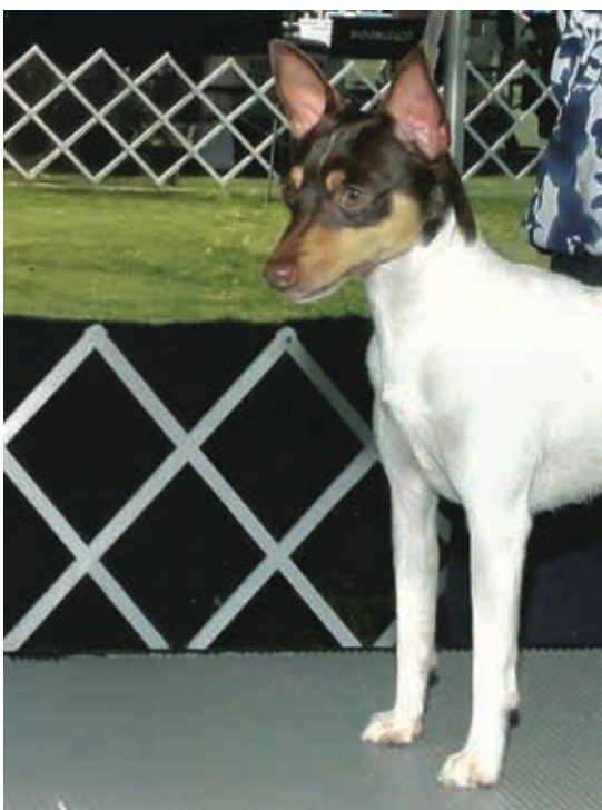
Chocolate and Tan.

No matter what the accompanying color is, the Toy Fox Terrier body is over 50 percent white, with or without spots. The body includes the underside. Not too long ago there was quite a stir when a judge disqualified a lovely Toy Fox Terrier for not having enough white, but refused to look at the underside. Judges need to take the entirety of the dog's body into consideration when determining if the dog is more than 50 percent white, including the underside and belly of the dog. Please note, however, that there is not a preference for a completely white dog with no spots. This mistaken belief is occasionally encountered. When judging the dog, do not reward a dog simply for having more white or solid white, as the Standard clearly says with or without body spots.