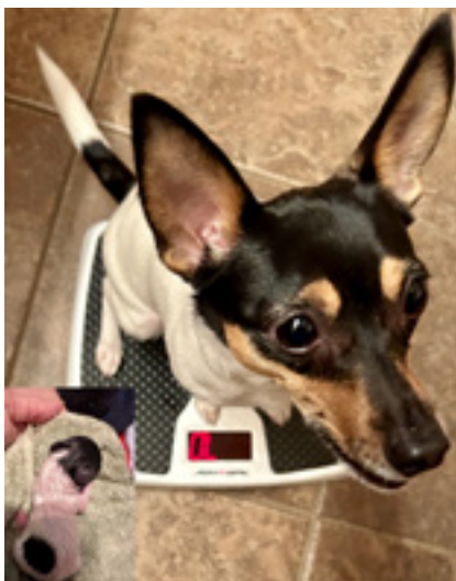
Above: A Toy Fox Terrier from 3 ounces at birth, to seven pounds as an adult; top: Toy Fox Terriers 9 and 11 inches—both ideal size.

9 to 11 inches tall, with 8½ to 11½ inches acceptable. Any height outside of those parameters is a disqualification, and the dog cannot be shown.